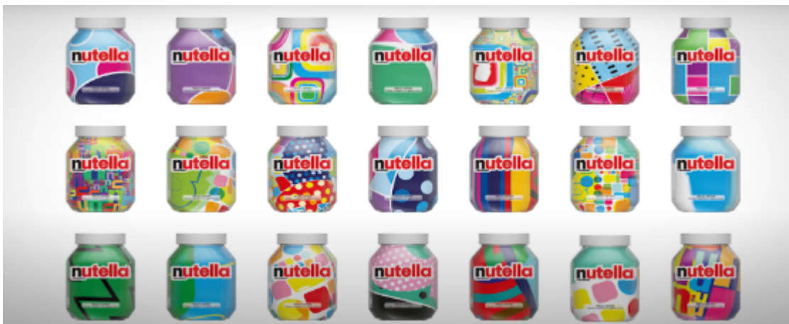
Source – Nutella

The effectiveness of artificial intelligence (AI) in ecommerce marketing was showcased in this campaign, which helped boost product differentiation and brand appeal.