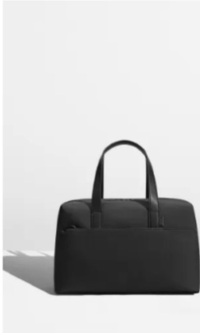
The Everywhere Bag $195