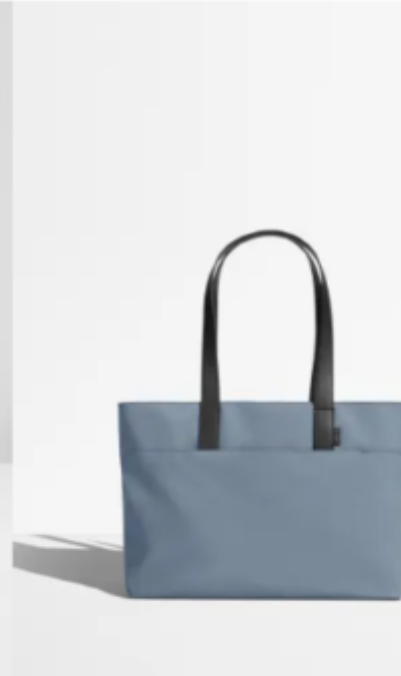
The Everywhere Tote $155