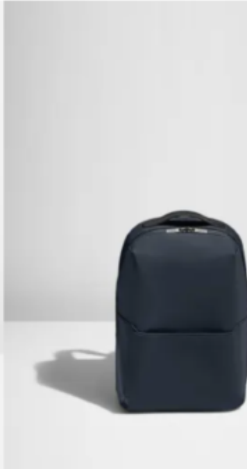
The Everywhere Zip Backpack $195