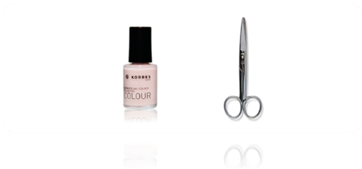
Image reflections are a key factor to consider while framing your picture. You can't just randomly place your images and expect a perfect shot. It's all about strategically placing the image in the right spot, in the right direction, which makes it look impressive.

It's best to keep reflections to a minimum, most of the time. The best way to do this is to adjust your lighting setup before taking the pictures. Shadows can be eliminated instantly with blackboards, diffusers, and absorbers.