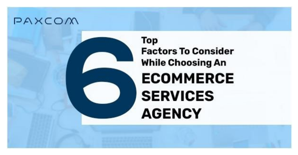
Top 6 Factors to consider while choosing an eCommerce services agency