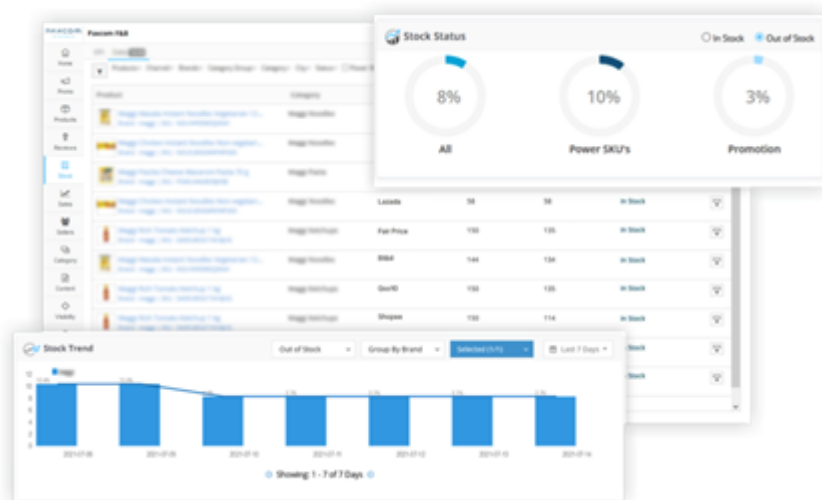
Paxcom's OOS dashboard screenshot