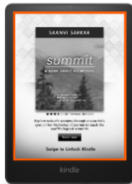
Full-screen ad on locked Kindle E-reader