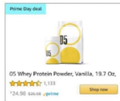
e-commerce ad with Prime Day deal badge and shop now button