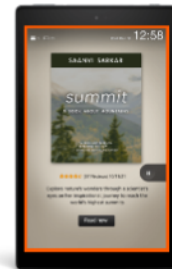
Full-screen ad on Amazon Fire tablet in full-color display

When readers tap your ad, they are sent to your book's detail page, where they can easily purchase and download your title. 2