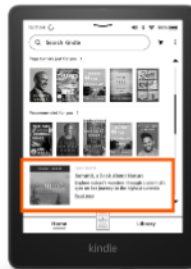
Home screen ad on Kindle E-reader