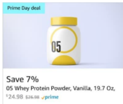
e-commerce ad with Prime Day deal badge and percentage savings message