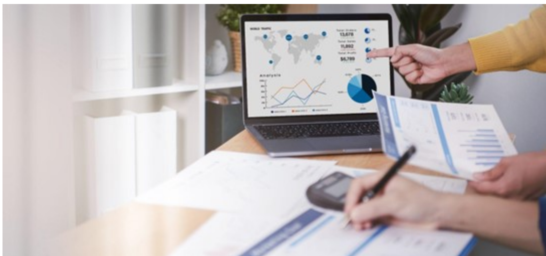
Frequent data analysis