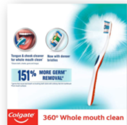
Image highlighting the USP and Facts about the product builds curiosity among the customers

Image giving out social message, helps to build trust among the customers towards the brand