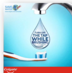
Image giving out social message, helps to build trust among the customers towards the brand