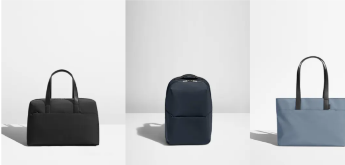
The Everywhere Bag $195